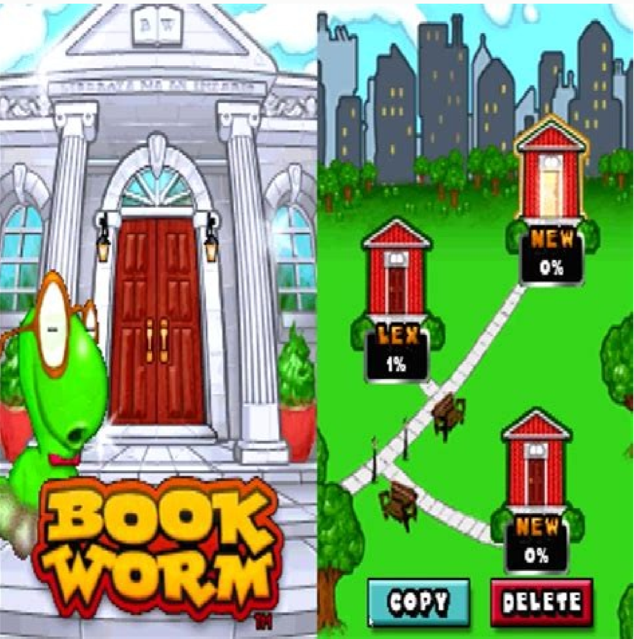
Bookworm adventures free download for mobile. Fun adventure books for adults. Travel adventure books for adults.